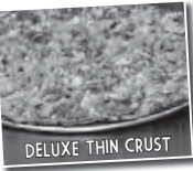
DELUXE THIN CRUST