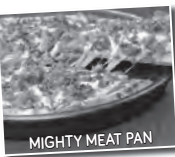
MIGHTY MEAT PAN